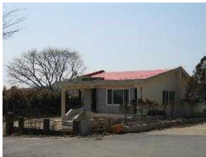
A Studio 1, 2